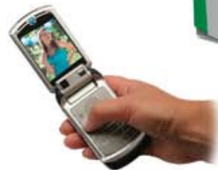
Camera Phone Upgrade Kit Available (Bluetooth and IrDA)