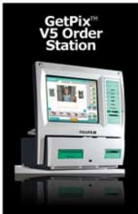
GetPix™ V5 Order Station