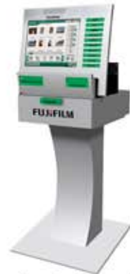
Pedestal and Scanner Also Available