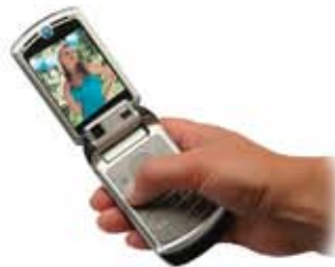
Camera Phone Upgrade Kit Available (Bluetooth and IrDA)